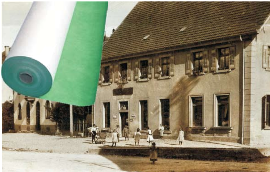
Hofatex® SBA 0,02 during maintenance