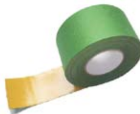
Hofatex® Tape SBA Repair Tape Adhesive tape to guarantee wind resistance and to repair framing